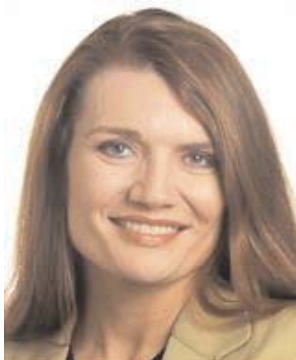
The Glass Castle author and MSNBC.com columnist Jeannette Walls

A resident of Welch, W.Va. during her youth, Ms. Walls relates with surprising warmth a sad and sometimes tragic childhood marred by poverty, abuse, neglect and family dysfunction. She and her siblings eventually escaped to carve out better lives for themselves. Ms. Walls moved out at age 17 to live with her older sister in New York City, where she eventually attended Barnard College and embarked on a career in journalism. Currently the online gossip columnist for MSNBC.com, Ms. Walls is also the author of Dish , a book tracing the evolution of celebrity gossip.